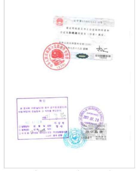
<From the Korean Embassy in China>