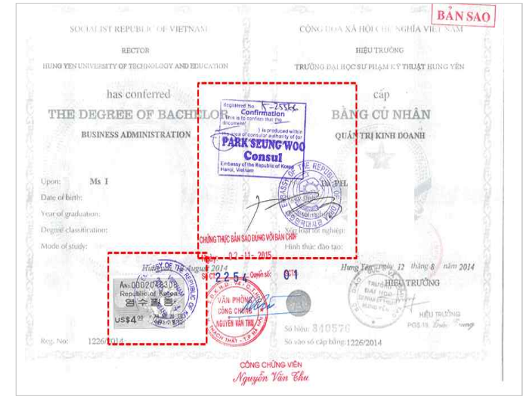
<From the Korean Embassy in Vietnam >