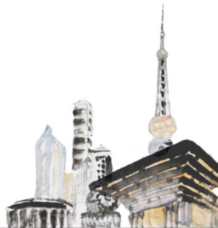
2016 ECUPL SUMMER SCHOOL IN CHINESE LAW