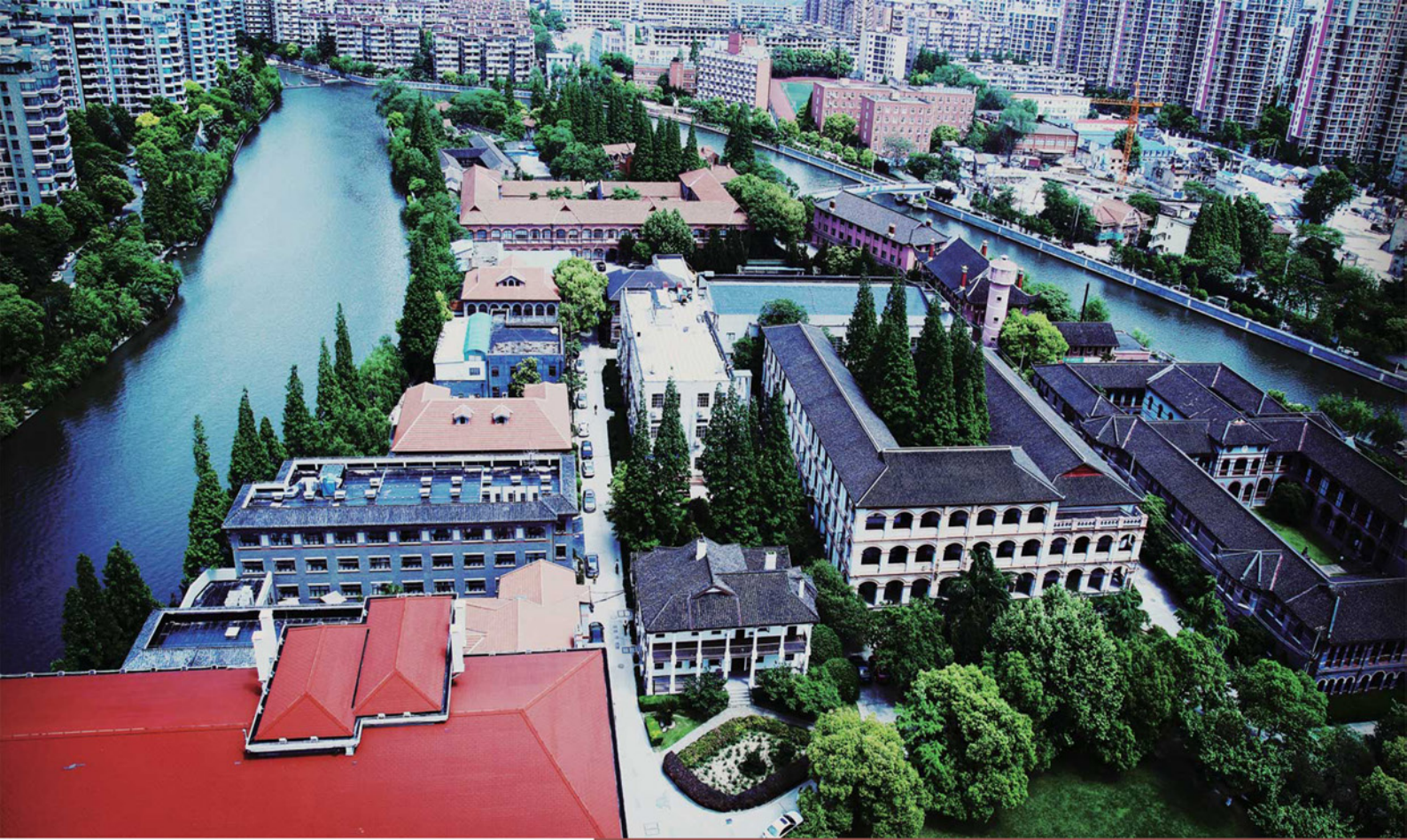
ECUPL CHANGNING CAMPUS