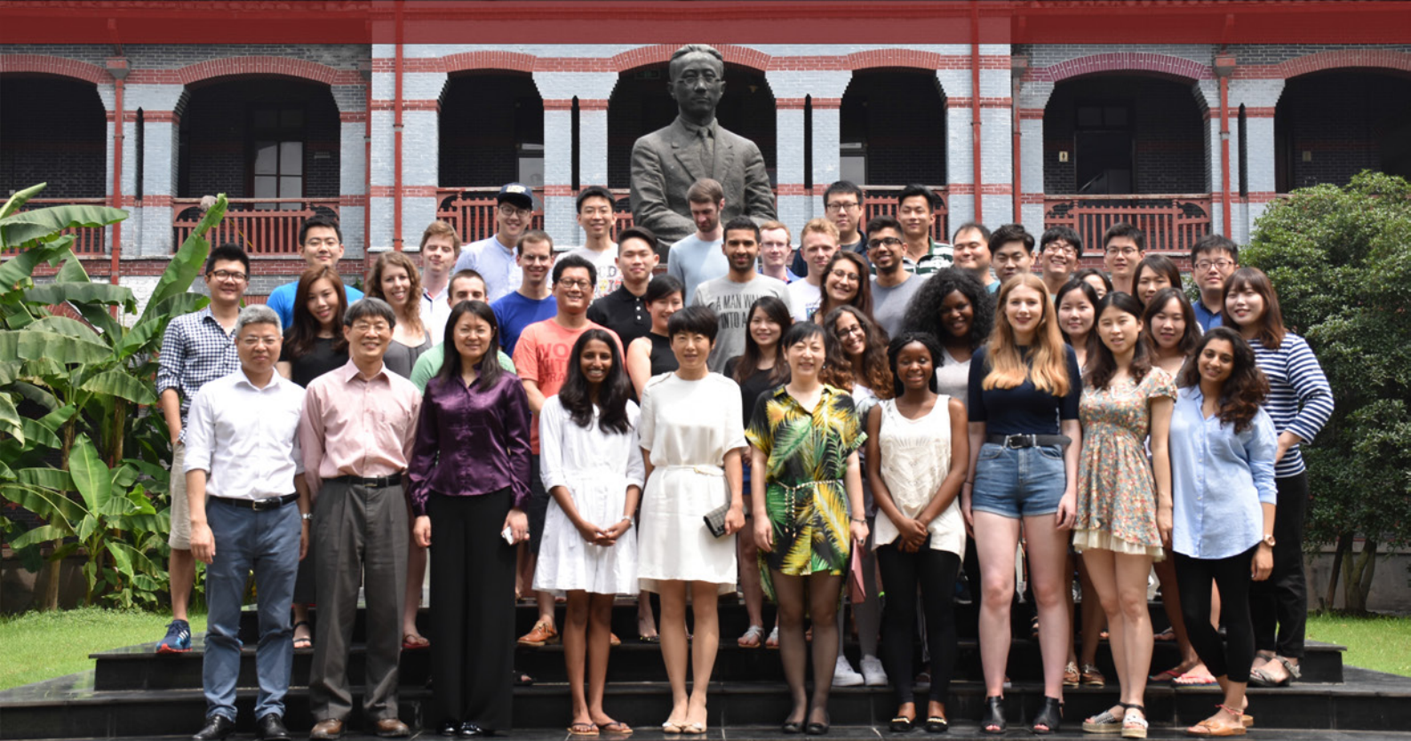
2015 ECUPL SUMMER SCHOOL IN CHINESE LAW