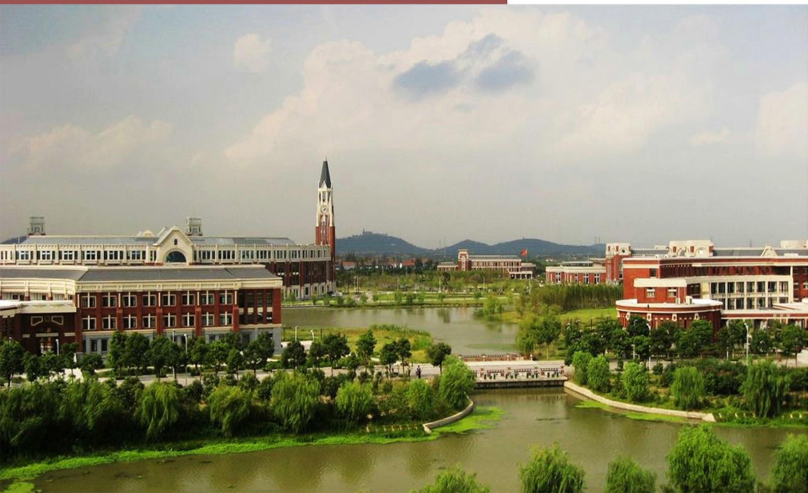
ECUPL SONGJIANG CAMPUS