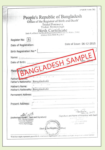
<Birth certificate in Bangladesh>