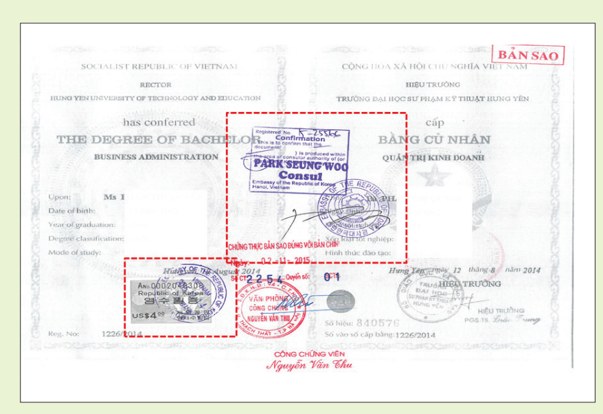
<From the Korean Embassy in Vietnam >

Verification of diploma from Korean Embaasy