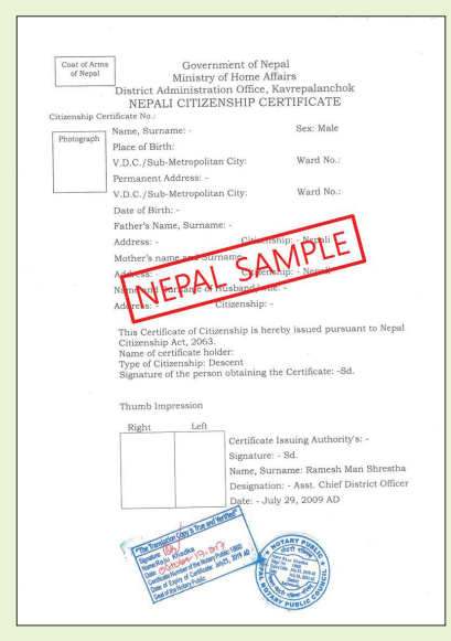
<Citizenship certificate in Nepal>

Verification of diploma from Korean Embaasy