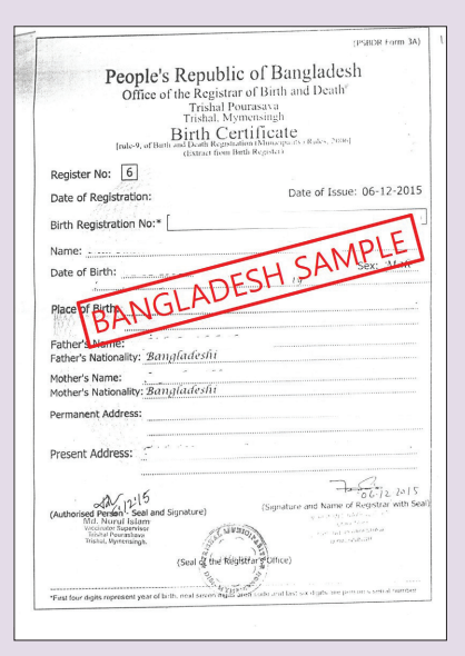
<Birth certificate in Bangladesh>