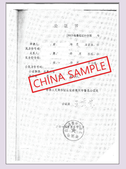
<Family relationship issued by Notary public>

Birth certificate or Family relationship certificate (If documents is not in Korean or English, translation is mandatory)