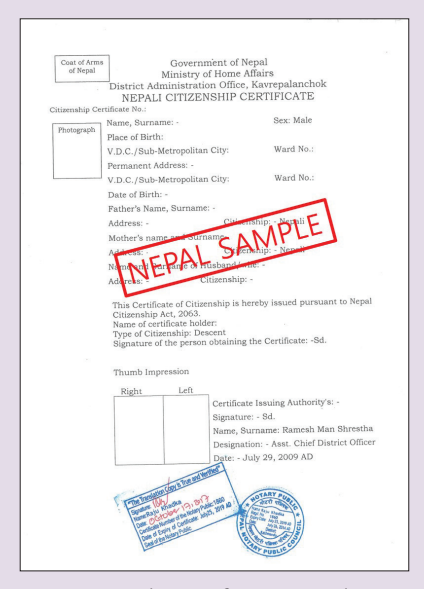
<Citizenship certificate in Nepal>

Verification of diploma from Korean Embaasy