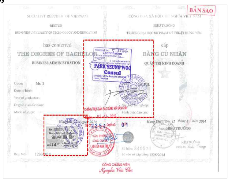
<From the Korean Embassy in Vietnam >