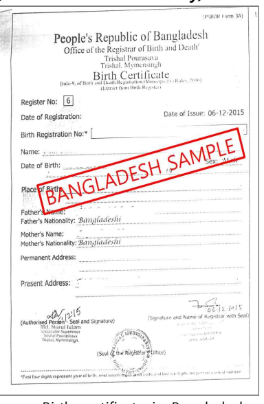
<Birth certificate in Bangladesh>