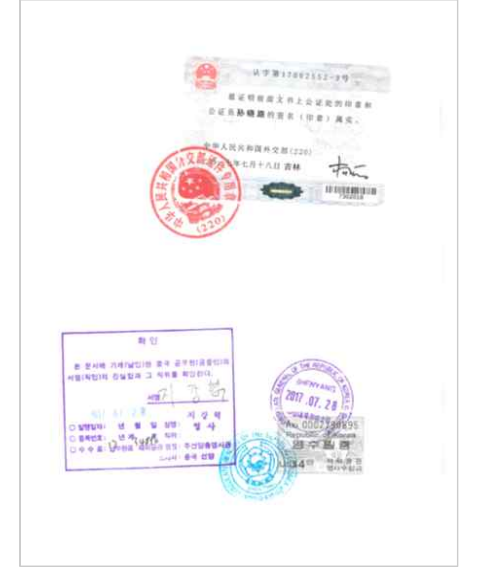
<From the Korean Embassy in China>