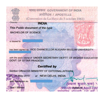
<Apostille form in India>