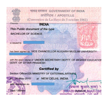
<Apostille form in India>