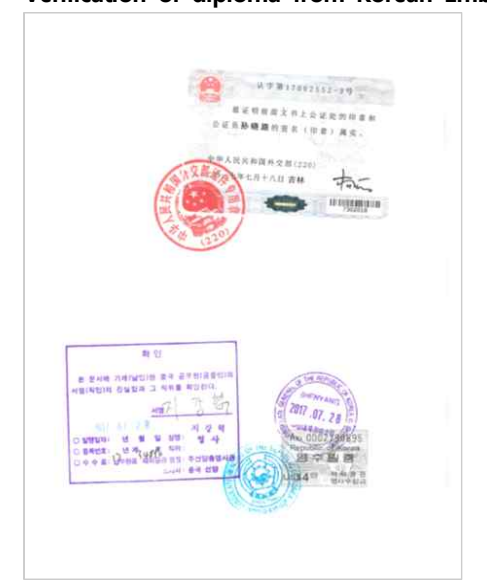
<From the Korean Embassy in China>