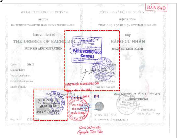
<From the Korean Embassy in Vietnam >