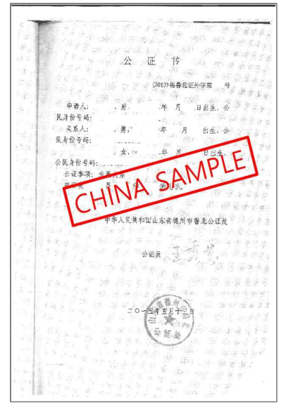
<Family relationship issued by Notary public>