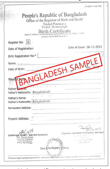
<Birth certificate in Bangladesh>