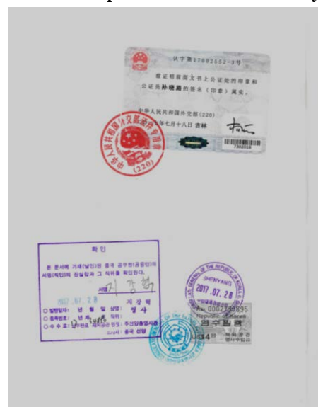
<From the Korean Embassy in China>