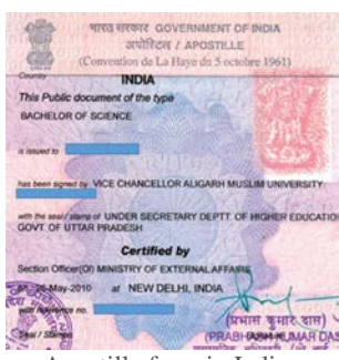
<Apostille form in India>