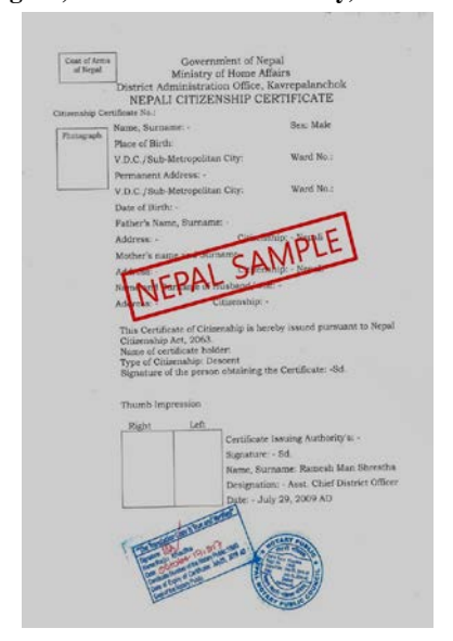
<Citizenship certificate in Nepal>