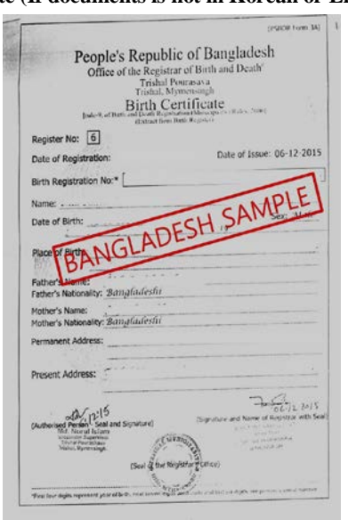
<Birth certificate in Bangladesh>